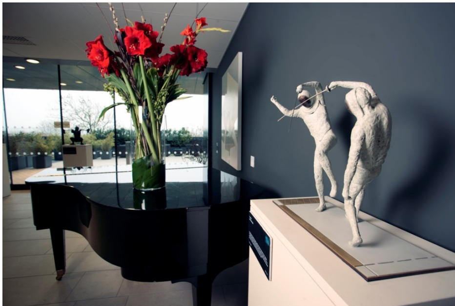
A preview exhibition of 10 of the bronze sculptures is currently on display and open to the public in the stunning reception of CircleBath until 24th March.

The project's cultural legacy will be two permanent sculptures honouring Bath's Olympic heroes and six 'Art in the City' sculpture sites, which will become permanently designated areas for public sculpture exhibitions in 2013 and beyond. The sites will be located in Parade Gardens, Queen Square, Sydney Gardens, Victoria Park, Green Park and Saw Close.